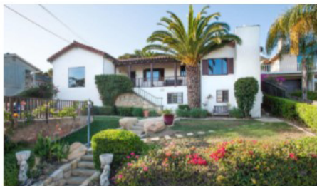
902 Paseo Ferello, SB