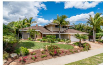
5432 San Patricio Dr.